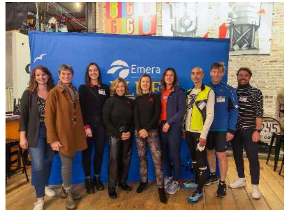
The Emera team at the 2023 Blue Nose Marathon Launch.

This year, Blue Nose Marathon celebrated 20 strong years of community-building. Since the inception of Blue Nose, the organization has been focused on creating a safe and welcoming environment to celebrate healthy living and physical activity; however, they recognize that creating space for everyone to feel welcome at the start line comes well before race day. As an extension of Blue Nose Marathon’s longstanding efforts to ensure people of all abilities are included, the organization collaborated with numerous equity-seeking groups across the province to explore and address what barriers exist for race participation. With the support of Emera, Blue Nose is continuing their journey towards creating an inclusive sporting event where all communities feel welcome. Not only did Emera introduce Blue Nose to many community groups to begin these conversations, but they also funded more than 115 race entry invitations to welcome group members to experience the excitement of the event.