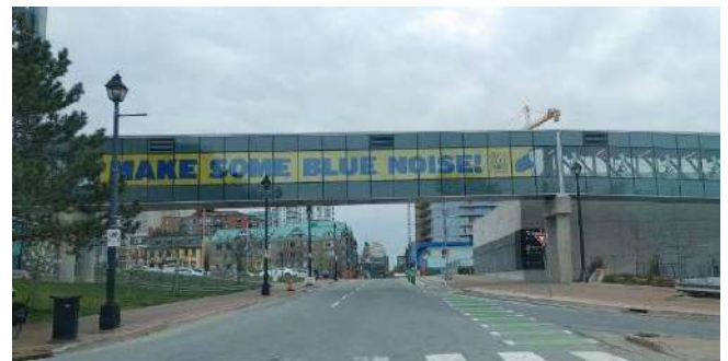
Cheer banner placed by Emera on Lower Water Street pedway.