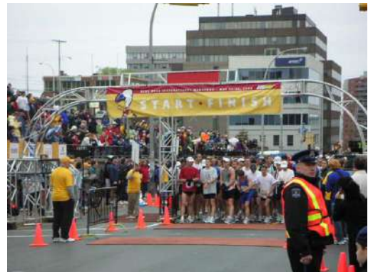
The first-ever Blue Nose Marathon start line.

In its inaugural year, Blue Nose Marathon welcomed just over 3,500 participants to the start line. Now, 20 years later, the event has more than doubled that figure, reaching over 8,100 participants with the support of the community, partners, volunteers and participants.