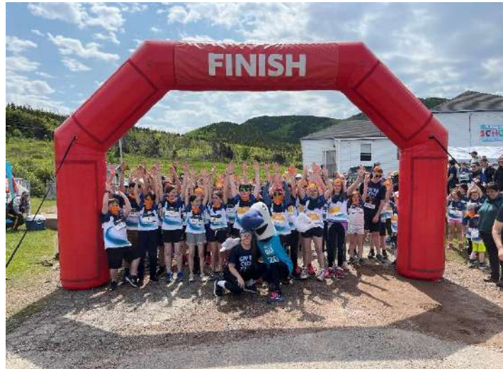
Pleasant Bay School, Cape Breton, Local Doctors Nova Scotia Youth Run.

Local Doctors Nova Scotia Youth Runs are a great opportunity for communities where distance prevents youth from attending the in-person event to get involved and celebrate physical activity and the great outdoors. Communities are welcome to organize a Local Youth Run, and Blue Nose Marathon supports the events by having staff attend and bring a finish line gantry, shirts, medals, refreshments, paint for blue noses and their beloved mascot, Myles.