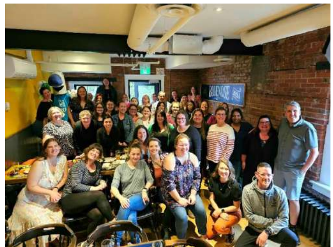
Team Myles Powered by Lifemark 2023 Graduation.

Team Myles applications are posted in the early new year and reviewed carefully by staff and coaches. Each participant becomes a living testament to the transformative power of movement, regardless of age or prior fitness experience.