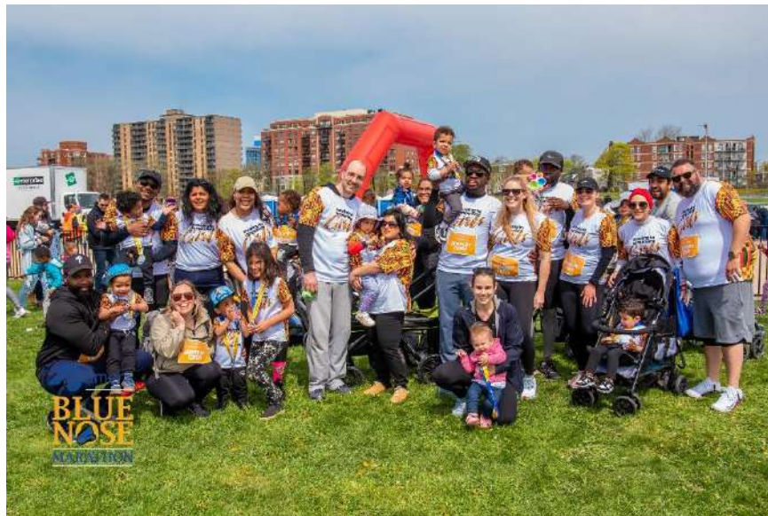
Team Aninga with The Aninga Project.

This year, Blue Nose Marathon had 61 Official Charity Partners and more than 400 fundraisers involved. Collectively, thanks to the dedication of our fundraisers and generosity of donors, the program raised more than $255,000 in support of many unique initiatives in our communities.