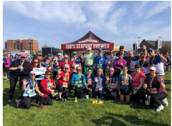
Learn 2 Run 5KM Running Clinic post-race of the Lifemark 5KM.

The L2R program runs twice a week for 10-weeks, consisting of two group running sessions and an in-class training component to learn all things running—clothing, footwear, hydration and more. The goal of the program is to build a running foundation and encourage more people to experience the unforgettable feeling of crossing a finish line. Registration for the 2023 program included two coaches and multiple pacers, a 10-week training plan, 50% off a Lifemark 5KM race entry, 10 clinics with professional speakers, 10 punch passes for Zatzman Sportsplex, a Blue Nose Marathon branded running belt, and more. The program was a great success, welcoming 53 participants in it's first year running.